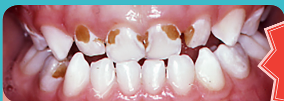
Brown or yellow spots that don't brush off